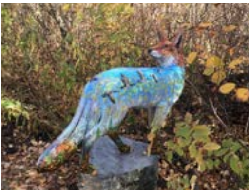
Joyce Locke The Canadian Geese, 2015